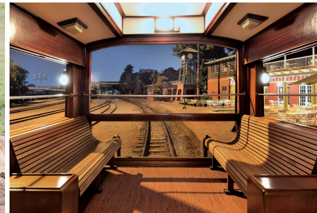
Great Southern Africa Train Adventures

From top left: Kruger National Park and the Kruger National Park Game Drive; the Kingdom of Swaziland; the world-heritage site, St Lucia Wetland Park; after tours of Durban's botanical gardens; Bloemfontein (the city of roses) and Kimberley's Diamond Mine Museum; arrive in Oudtshoorn to visit an ostrich farm and the incredible Cango Caves; traverse the Outeniqua Mountains to the natural paradise of Knysna for a lagoon ferry ride followed by a spectacular meander along the Garden Route towards Worcester; travel by road over scenic mountain passes to Hermanus, once a renowned whaling station, before arriving on the final day in Cape Town for a tour of the Mother City.